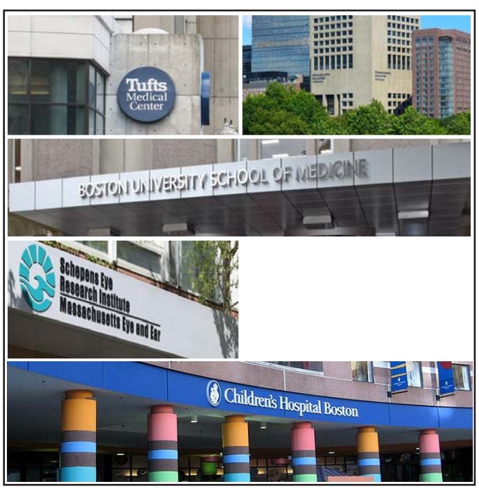
Over the years, the MLERFI has supported the following facilities:

Boston's Children's Hospital Boston University Medical School Brigham & Women's Hospital, Center for Ophthalmic Research Harvard University Department of Molecular & Cellular Biology Joslin Diabetes Center, Beetham Eye Institute Massachusetts Eye and Ear Infirmary New England College of Optometry Schepens Eye Research Institute Tufts University School of Medicine, NEEI University of Massachusetts, Lowell UMass Medical School-Worcester UMass Memorial Medical Center